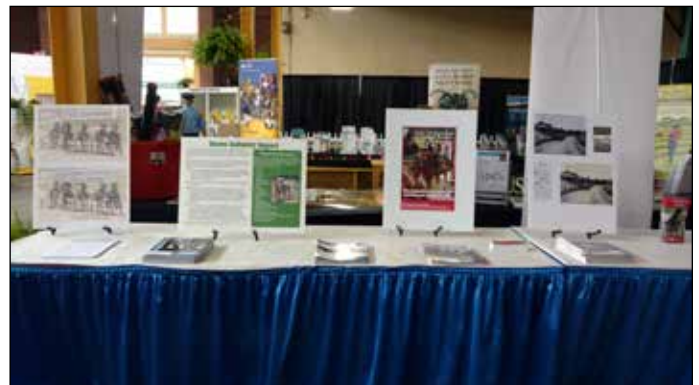
2017 Ohio State Fair Booth