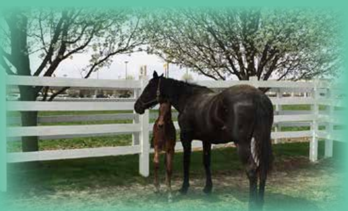
2017 Filly Captaintreacherous & Fox Valley Topaz