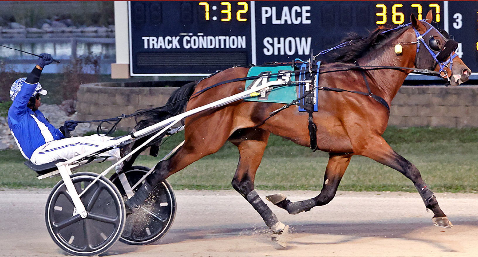
Big Ranger - 2025 Ohio Triple Crown & Ohio Horse of the Year

This guide includes 2026 forms for Ohio-bred restricted stakes, including: Ohio Sires Stakes, Buckeye Stallion Series, Ohio Breeders Championships, Ohio State Fair Stakes, Ohio County Fair Circuits, and other stakes hosted in Ohio.