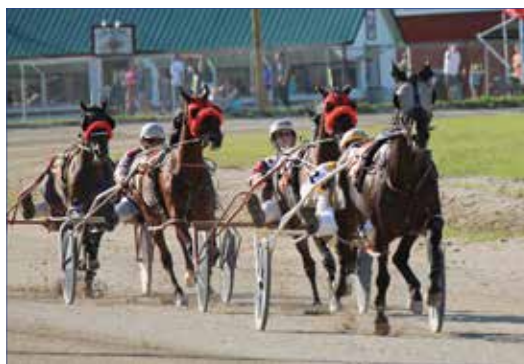
Cover photo: Racing at Defiance Co. Fair, Hicksville, Ohio.