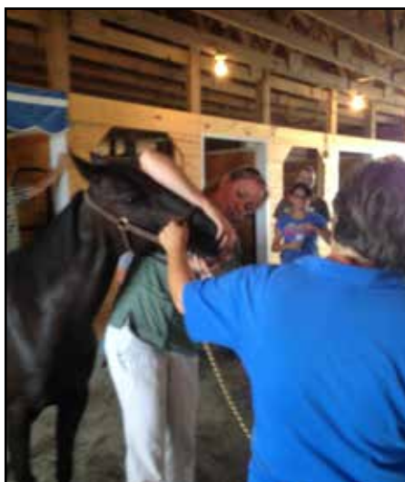
Kessen Vet Clinic demonstrated the importance of gum color.