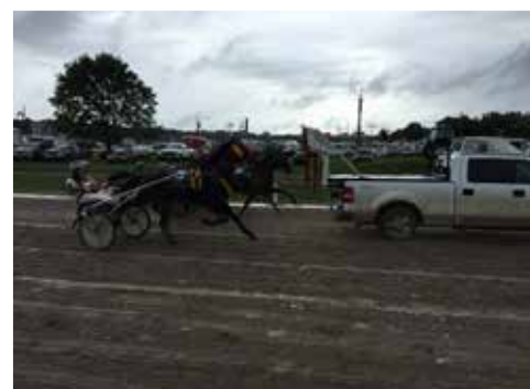
Muskingum County Fair.