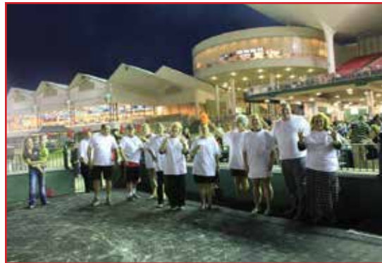
Charities cheer on their horses in Race 8.

Make-A-Wish® Ohio, Kentucky and Indiana grants the heartfelt wishes of children between the ages of 2 ½ and 18 battling life-threatening medical conditions. A wish granted is an essential part of the treatment process, this is what families say and what doctors believe. These are kids battling cancer, heart problems, and a host of other tough challenges. They often live in a climate of "no" — no friends, no playing outside,