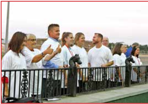
Charities cheer on their horses in Race 6.

Centennial and 100 Years of Service. Nationally the Red Cross officially began serving those in need in 1881. Our mission is to prevent and alleviate human suffering in the face of emergencies by mobilizing the power of volunteers and the generosity of donors. Red Cross primarily is charged with being there to help everyone in times of disaster and serving our armed forces and their family members. Additionally, our local services include Emergency Response, Health and Safety Education (First-Aid and CPR/AED training), free Senior medical transportation, Prevention Education, and Blood donations to provide 100% of the blood supply regionally every hospital.