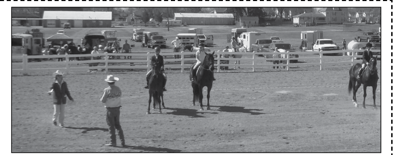
Continued on page 3 Judging of the 12 & under age group -2-Gait Pleasure class.

Ohio Standardbreds and Friends will host the second show on June 18th at