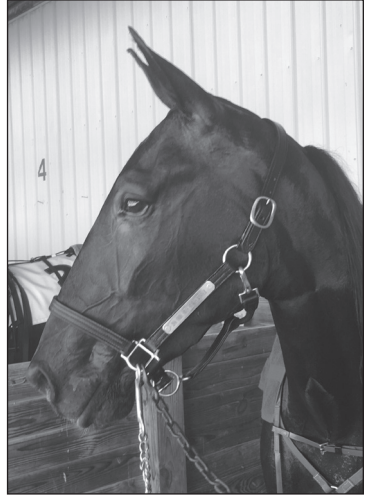
Gofer at the Delware County Fair

Share something fun about yourself. When I was a child I received the Littlest Groom Award from Pompano Park because I would go in and help my parents in the barn when I didn't have school.