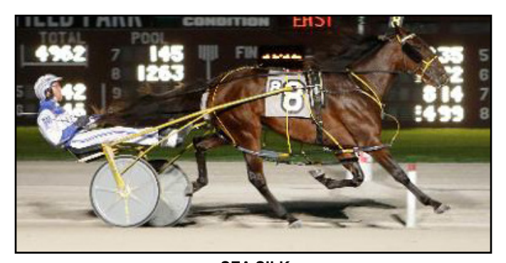
SEA SILK 2-Year-Old Filly Pacing Champion