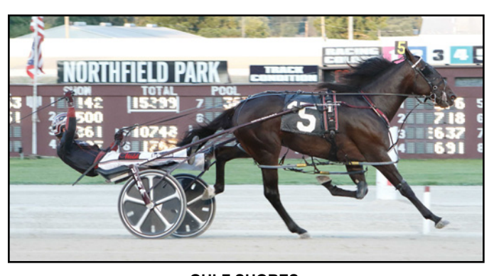
GULF SHORES 2-Year-Old Colt Pacing Champion