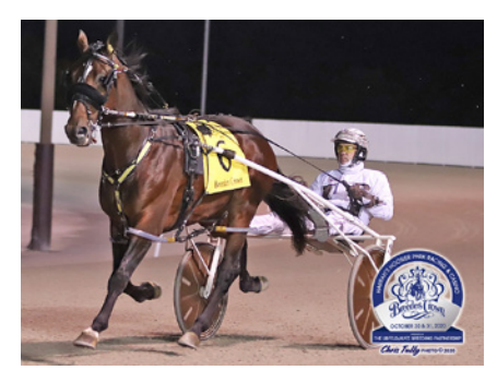
Summa Cum Laude to stand at Midland Acres

World Champion Guardian Angel AS will stand the 2022 breeding season at Autumn Lane Farm in Thornville, Ohio. Guardian Angel AS earned over $1.5 million dollars during his racing career, taking a mark of 1:50.1 as a 6-year-old. The son of Archangel will be the fastest and highest money winning trotting sire standing in Ohio.