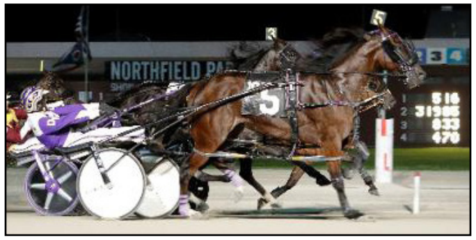
BORNTOBESHAMELESS 3-Year-Old Colt Pacing Champion