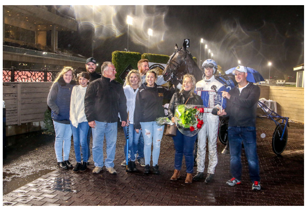
The Monte Miki winners circle celebration