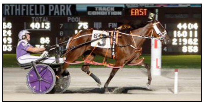
SMOTHASTENESEWISKY 3-Year-Old Filly Pacing Champion