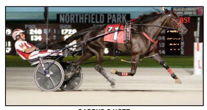
GABBYS C NOTE 2-Year-Old Filly Trotting Champion