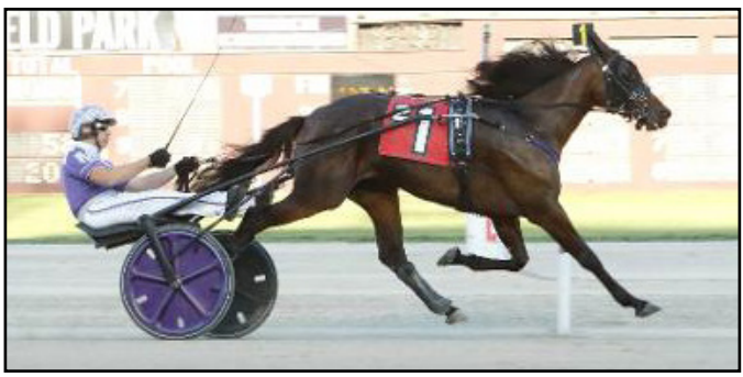
HERCULISA 3-Year-Old Filly Trotting Champion