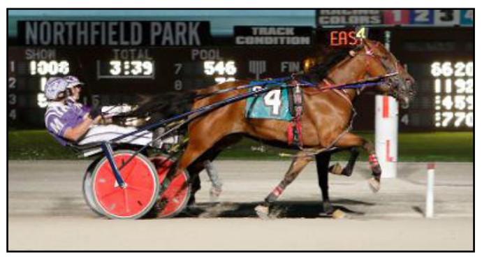
THE MIGHTY HILL 2-Year-Old Colt Trotting Champion