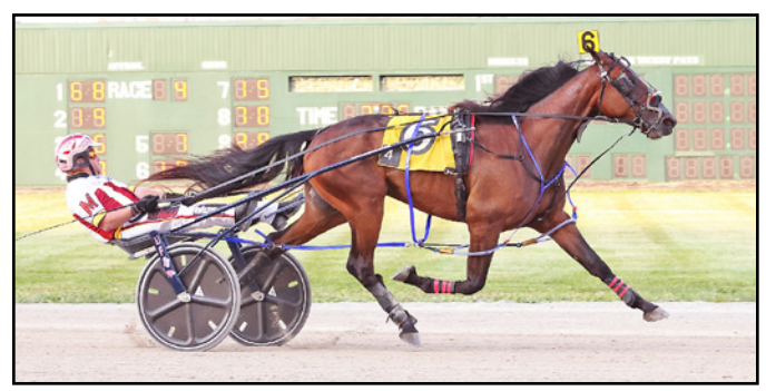
WINNING TICKET 3-Year-Old Colt Trotting Champion