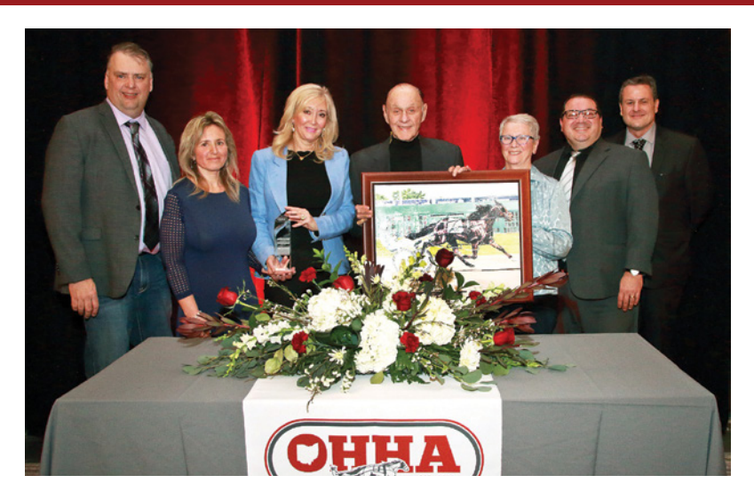
2019 Horse of the Year, Elver Hanover's Presentation