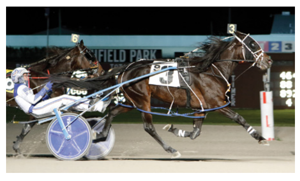
Mr. Ds Rock

Kissin In The Sand recorded her seventh win in a row, en route to