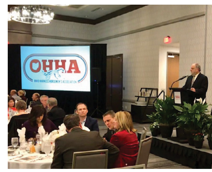
2020 OHHA Annual Banquet

Traditionally, the OHHA annual meetings are held in conjunction with the United States Trotting Association District 1 annual meeting. The USTA