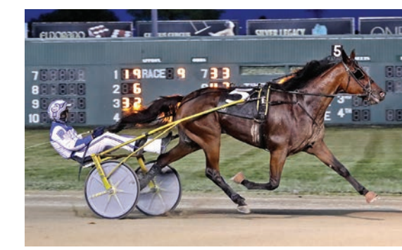
A Fancy Face

On Saturday August 1, the spotlight was shared by the 2CP, 3CT and