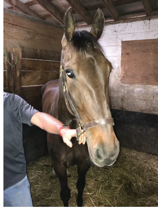
Its Mv Check GB

Portrstownchris IR has taken a little longer to get up to speed. "He has had a big break since the last he worked so he took a little longer to get with the program. As he has come along, he is very willing and wants to roll on."