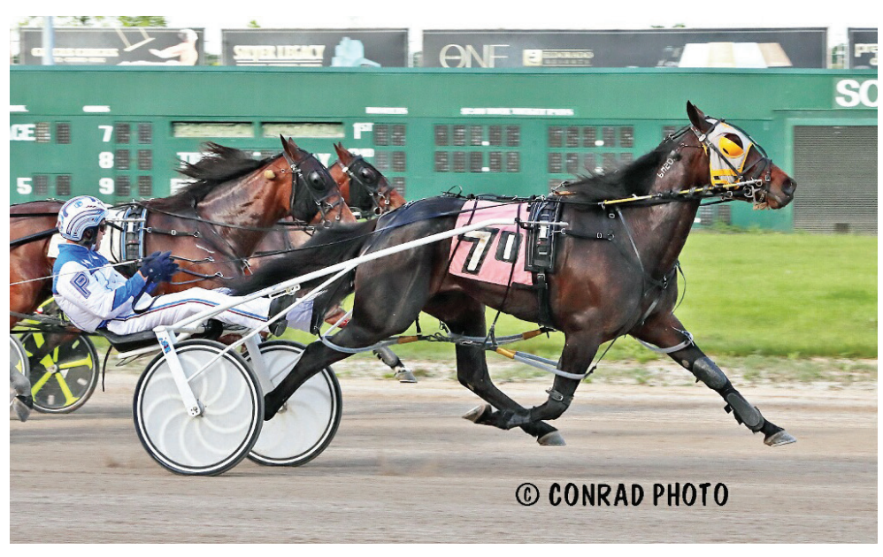
Duck Duck Dragon wins first race back after pandemic shutdown

After 52 days with no harness racing in North America, Eldorado Scioto Downs opened with a bang. Chris Page drove Duck Duck Dragon to victory in the first race as Scioto Downs eclipsed the million-dollar mark in wagering for the first time in l ong time.